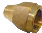
550-00626 SAE FLARE NUT 3/8"