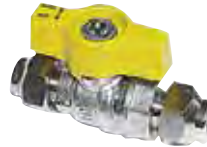
550-00650 FLARED BALL VALVE 3/8" X 3/8" BSP