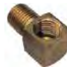
550-00624 SAE FLARE NUT 5/16"