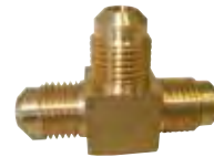
550-00620 SAE ALL MALE 3-WAY TEE CONNECTOR 3/8"