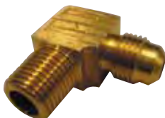
550-00644 SAE MALE X BSP MALE TAPERED ELBOW 5/16" X 3/8"