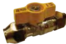
550-00700 GAS TESTING NIPPLE 3/8" flare x 3/8" male