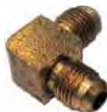
550-00618 SAE ALL MALE 3-WAY TEE CONNECTOR 5/16"