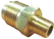
550-00638 SAE MALE X BSP TAPERED MALE UNION 3/8" X 1/4"