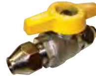
550-00652 FLARED BALL VALVE 1/2" X 1/2" BSP